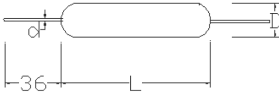
Table 1. Mechanical data